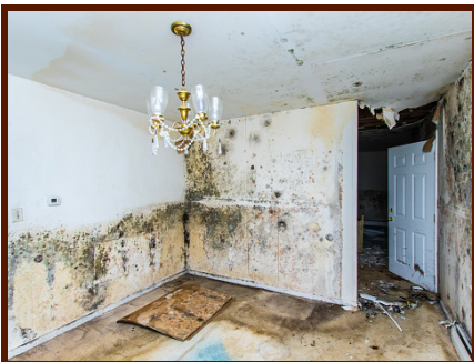
Home with major damage