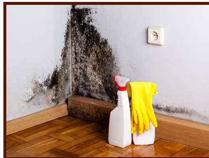
Moderate mold damage