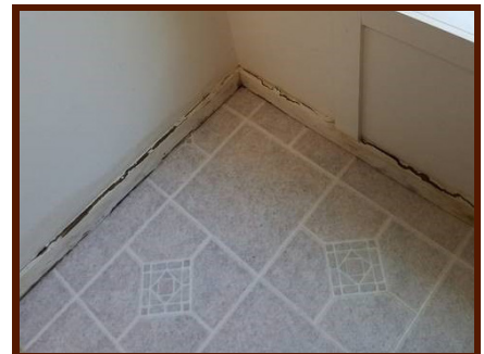
Minor water damage